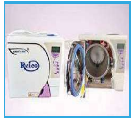
OPHTHALL RIECO AUTOCLAVE