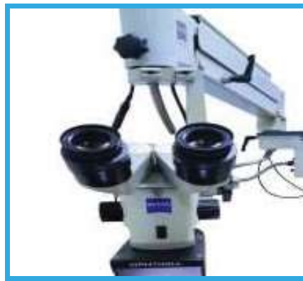
OPHTHALL GLO MASTER