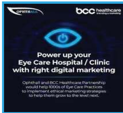
OPHTHALL BCC BRANDING