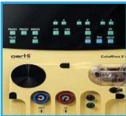
OERTLI PHACO MACHINES